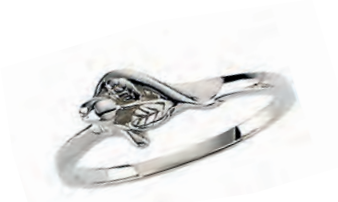
Unblossomed Rose Chastity Ring sterling silver, $24.99