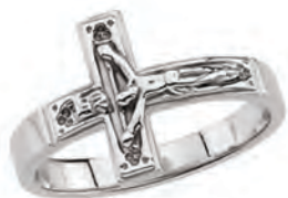
Crucifix Chastity Ring sterling silver, $42