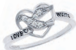
Dove and Heart Purity Ring sterling silver, diamonds, $89.95