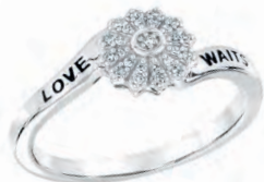
Love Waits Sterling silver, diamonds, $105.80