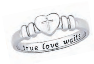
True Love Waits Purity Ring sterling silver, $29.95 (was $40)