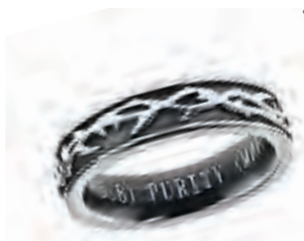
Crown of Thorns Purity Ring stainless steel, enamel, $29.95

A series of rings culled from online vending platforms. Prices as advertised in January 2016.